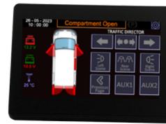
4.3in color display